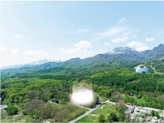
Planned Construction Site